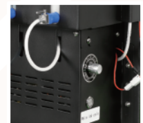
White Ink Circulating System