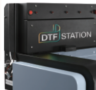
Auto Alarming Ink Consumption System