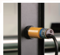
Film Reading Sensor