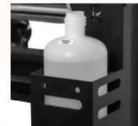
Cleaning Liquid Self-feeding System