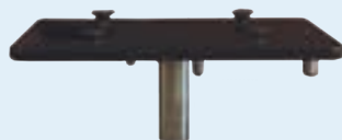
Optional Mounting Kit (Same as Touchdown Platen, Optional Purchase as well)