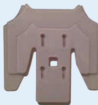
Three Shoe Platen Inserts